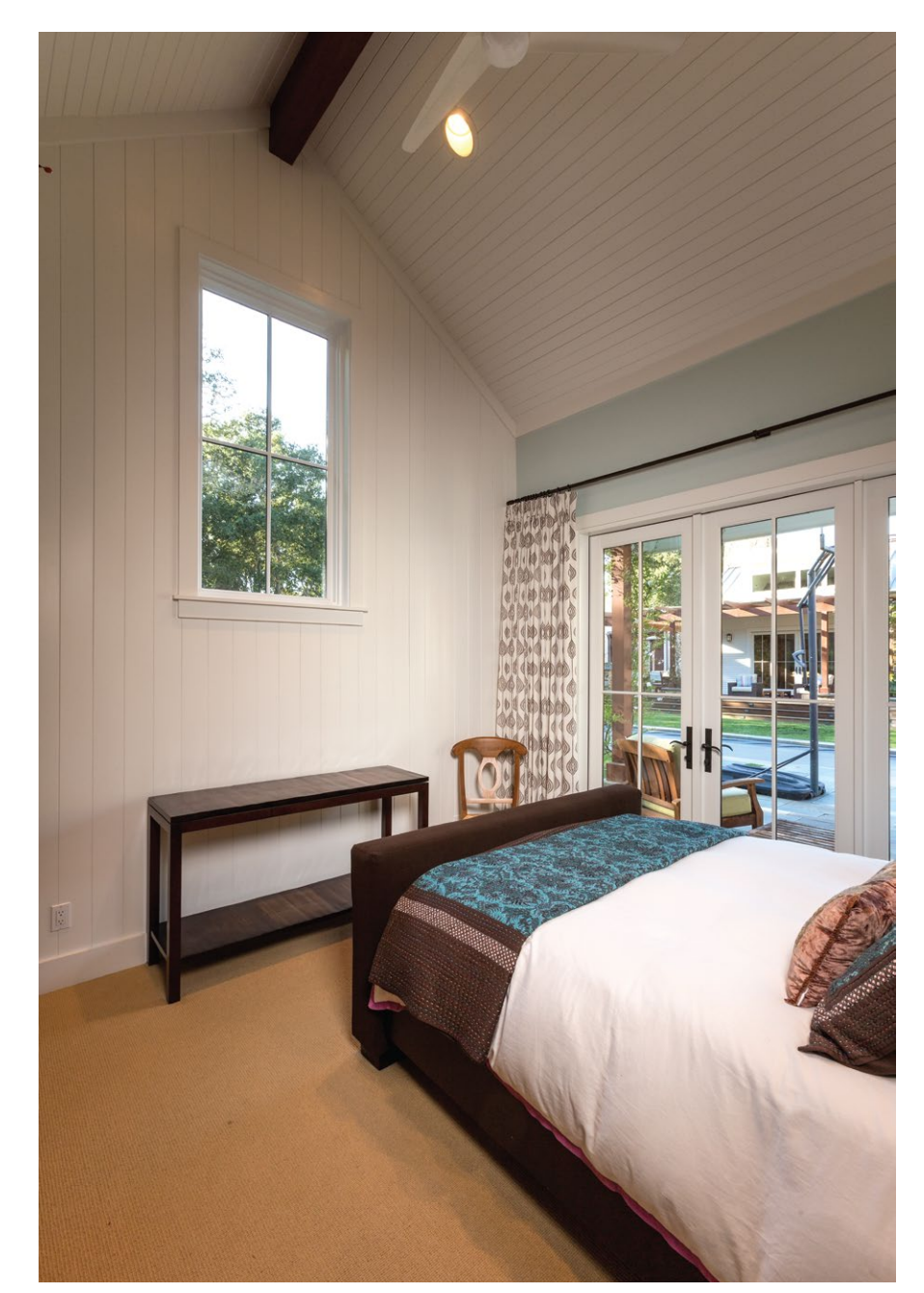
Pool house bedroom.