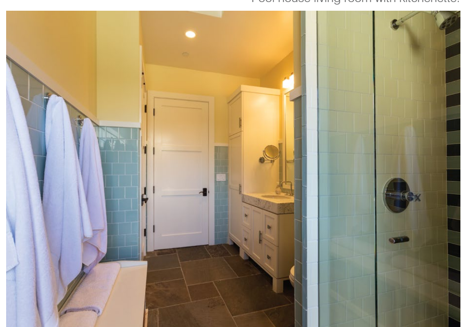
Pool house bathroom with interior and exterior access.