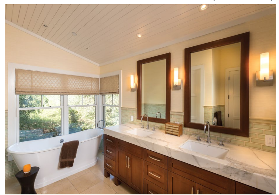
Custom wood vanity and marble countertop in master bathroom.