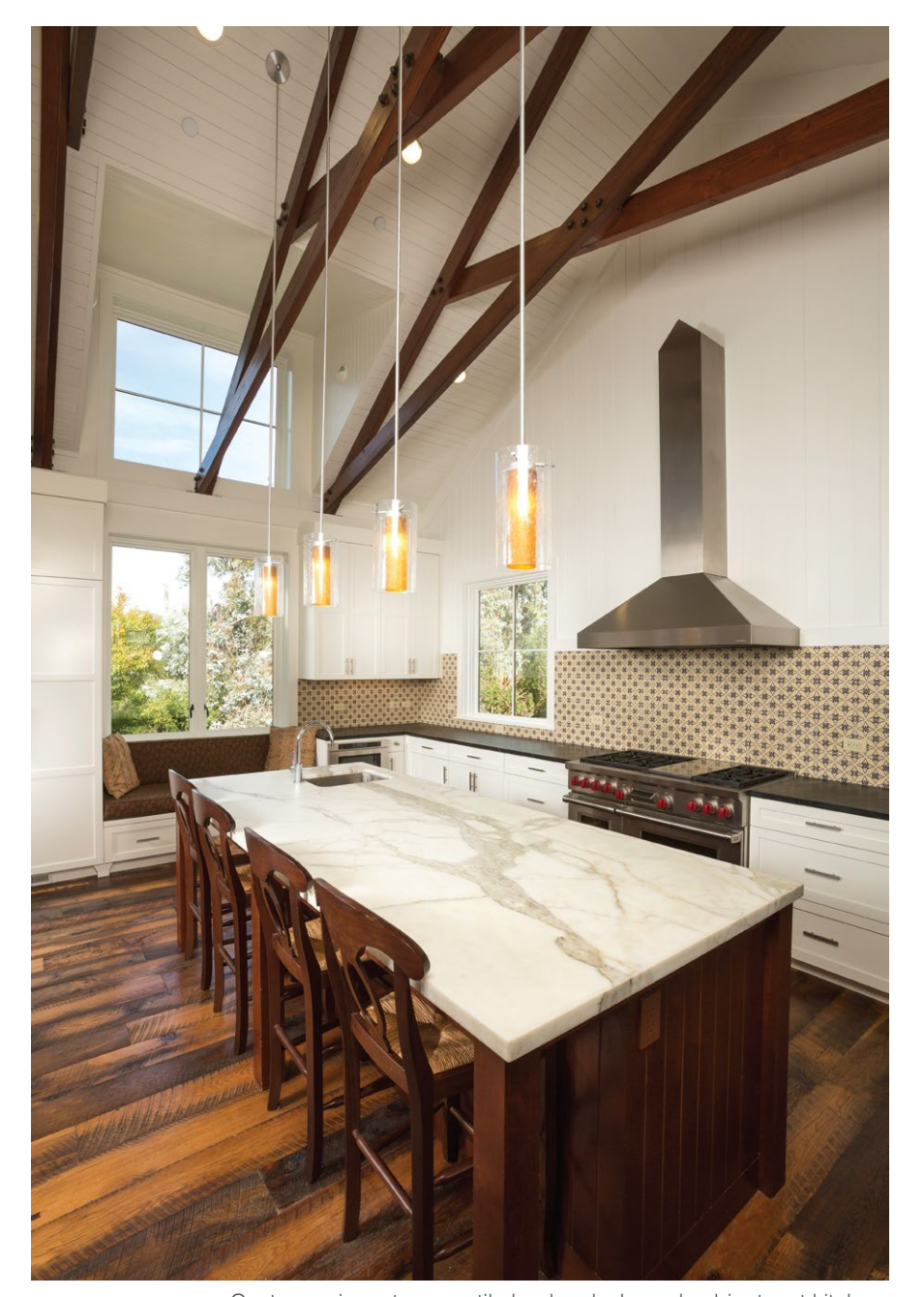
Custom scissor trusses, tile back splash, and cabinetry at kitchen.