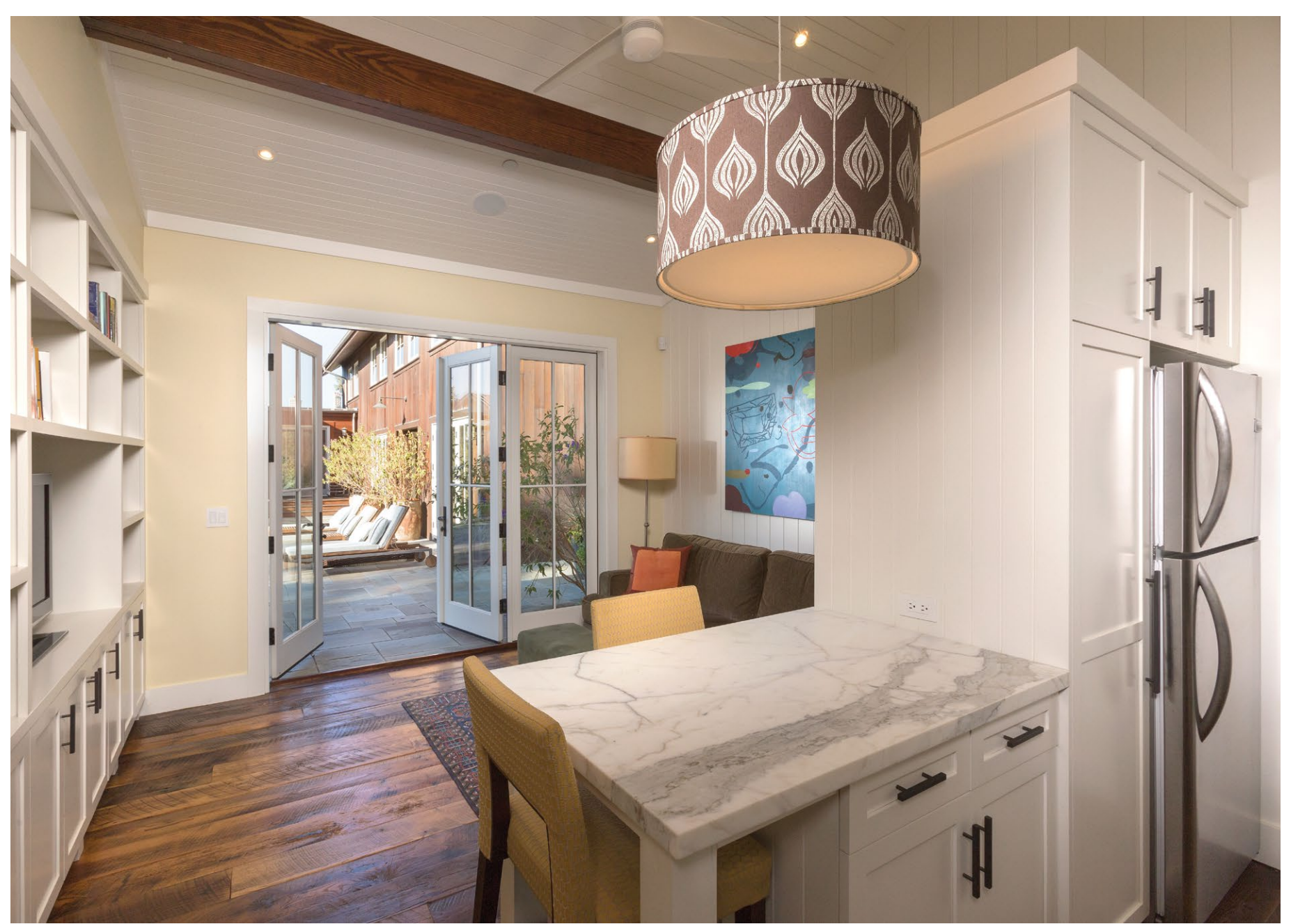
Pool house living room and kitchenette looking onto pool and two story barn wing.