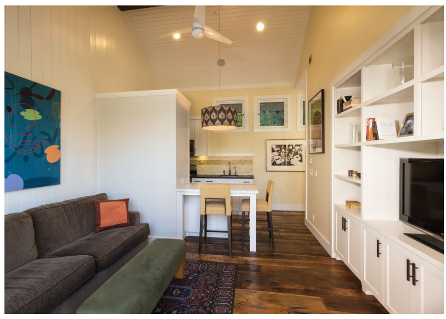
Pool house living room with kitchenette.