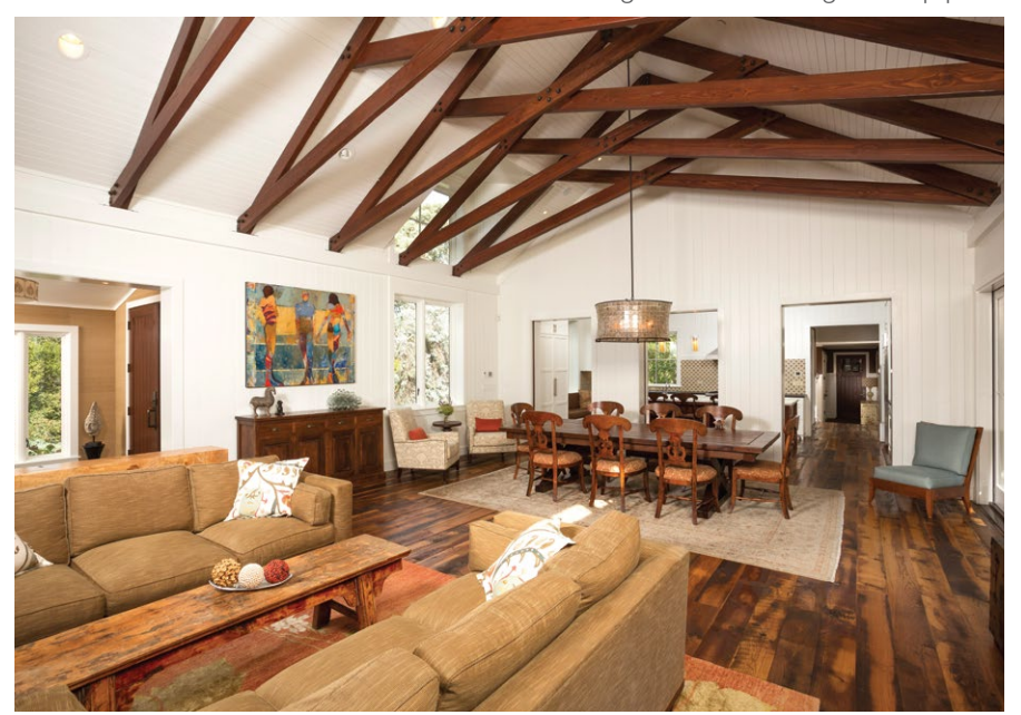
View of great room and entry looking towards kitchen.