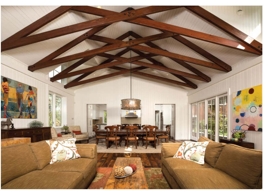
View of great room with custom, hand scraped, wood "scissor" trusses.