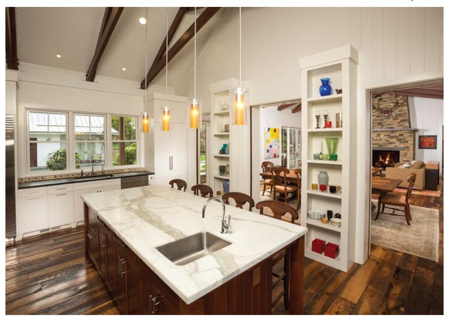
Pocket doors and built-in shelving separating kitchen from great room.