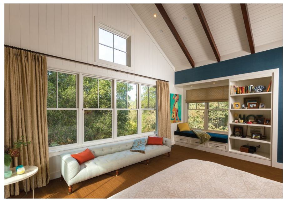
Built-in daybed and cabinetry.