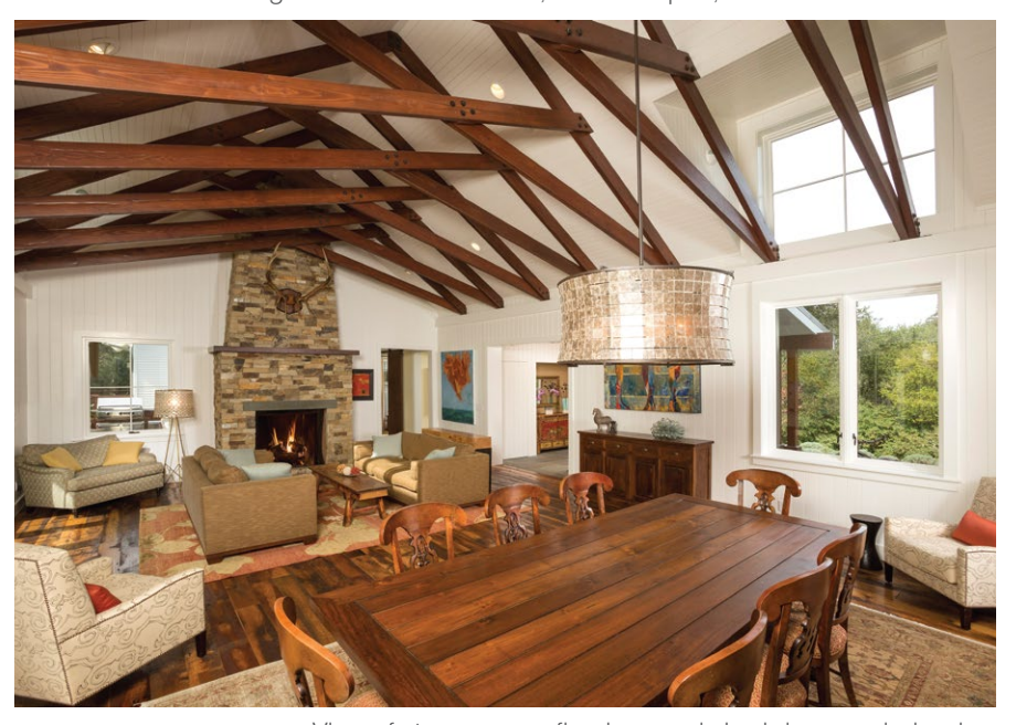
View of stone veneer fireplace and shed dormer window bay.