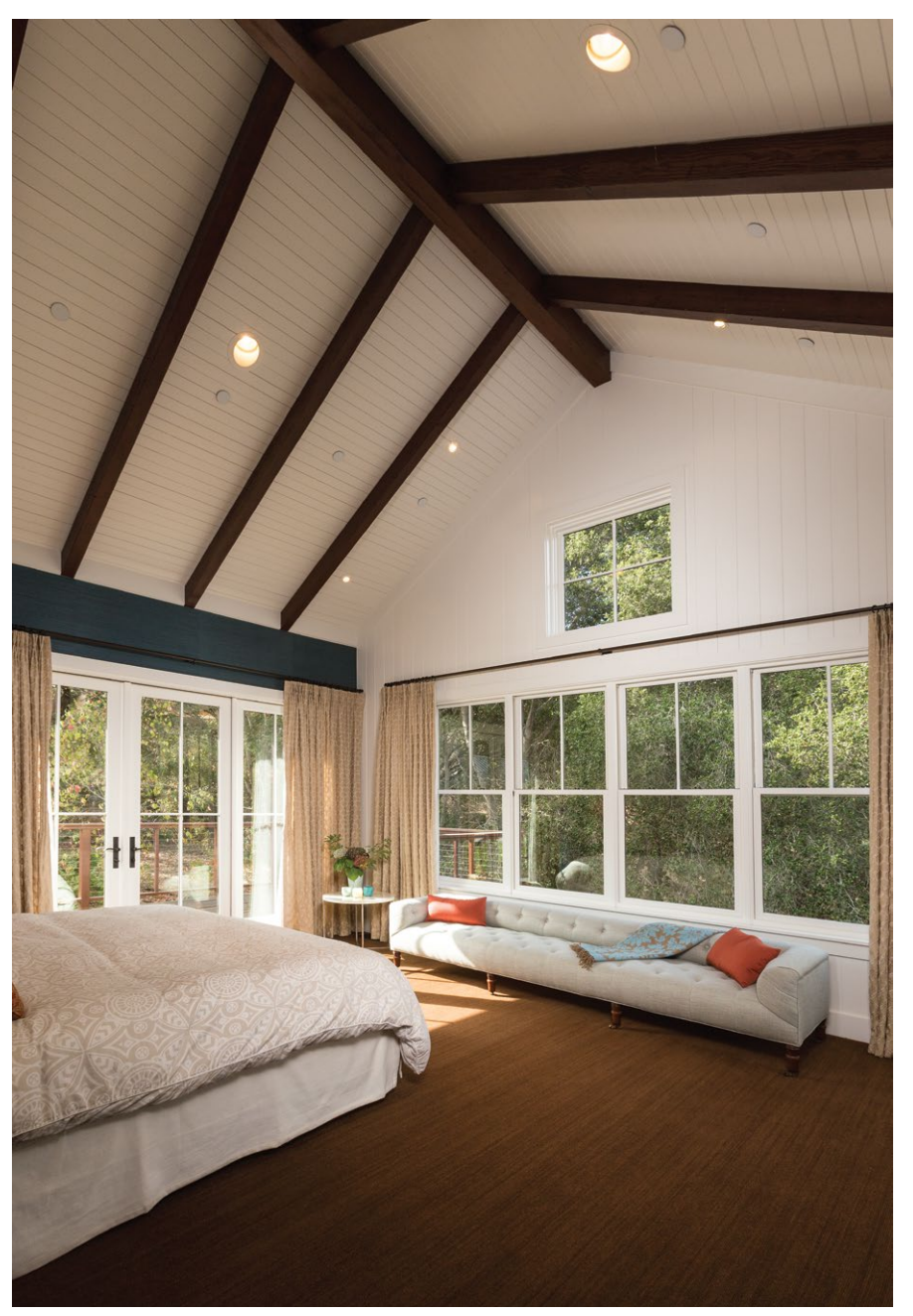
Vaulted ceiling, reclaimed wood beams, and custom paneling at master suite.