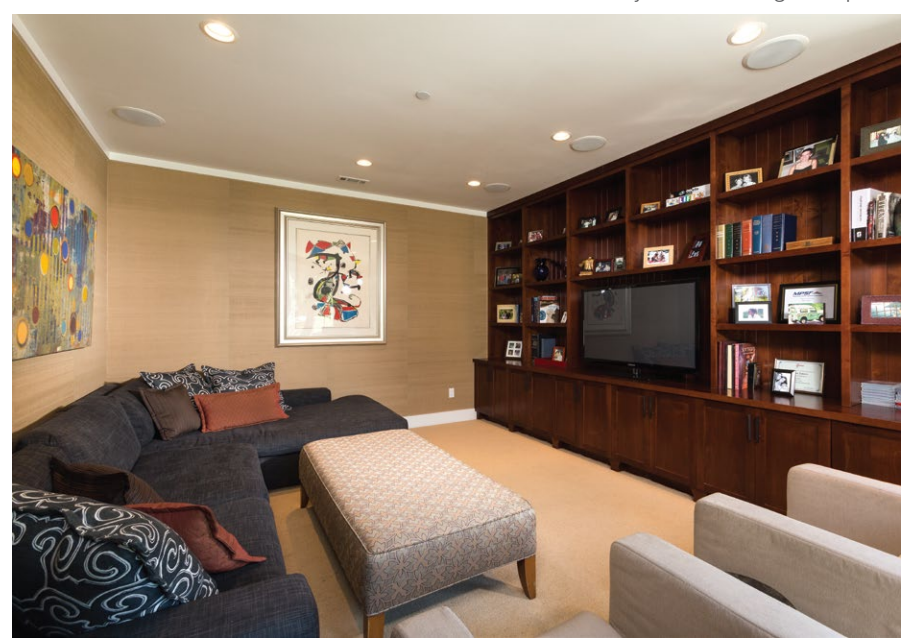
Family room with integrated media cabinetry.