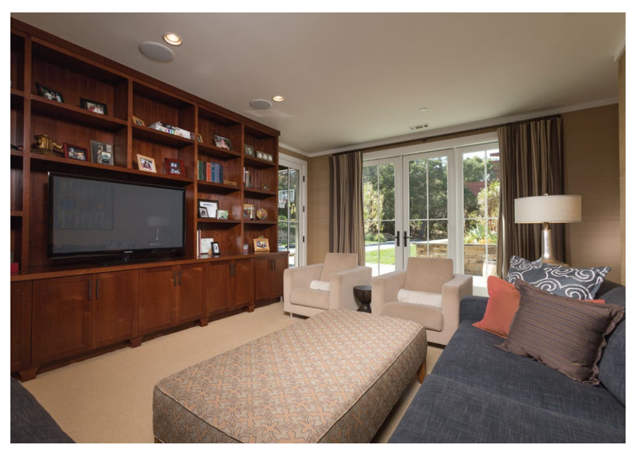
Family room looking onto pool.