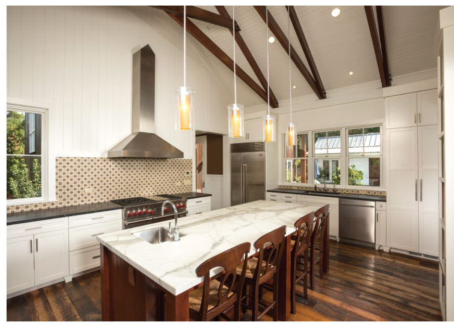
Custom kitchen island with views to front and rear yards.