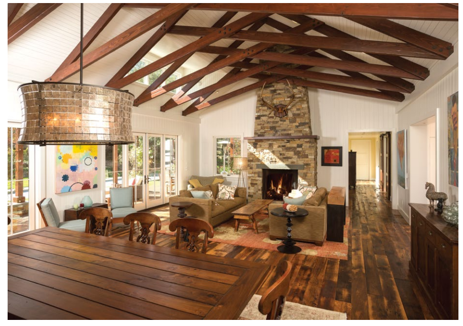
View of great room looking onto lap pool.