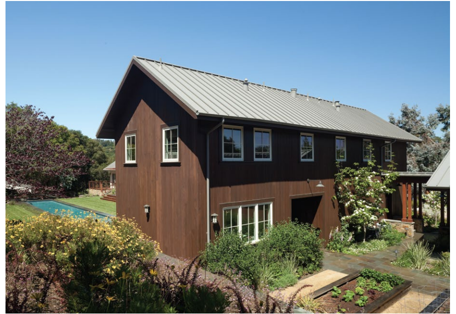
View of two story barn wing with lap pool beyond.