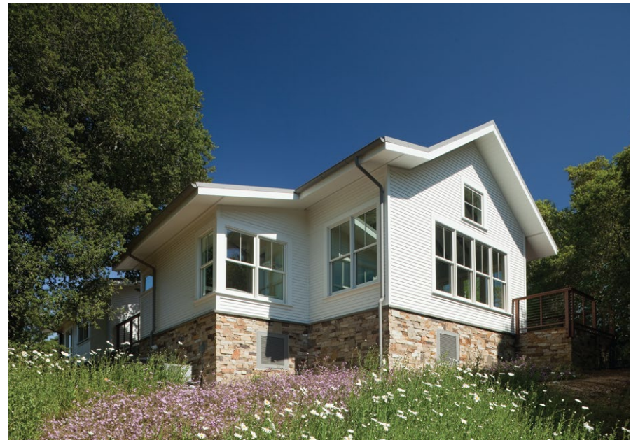
Secluded master bedroom suite.