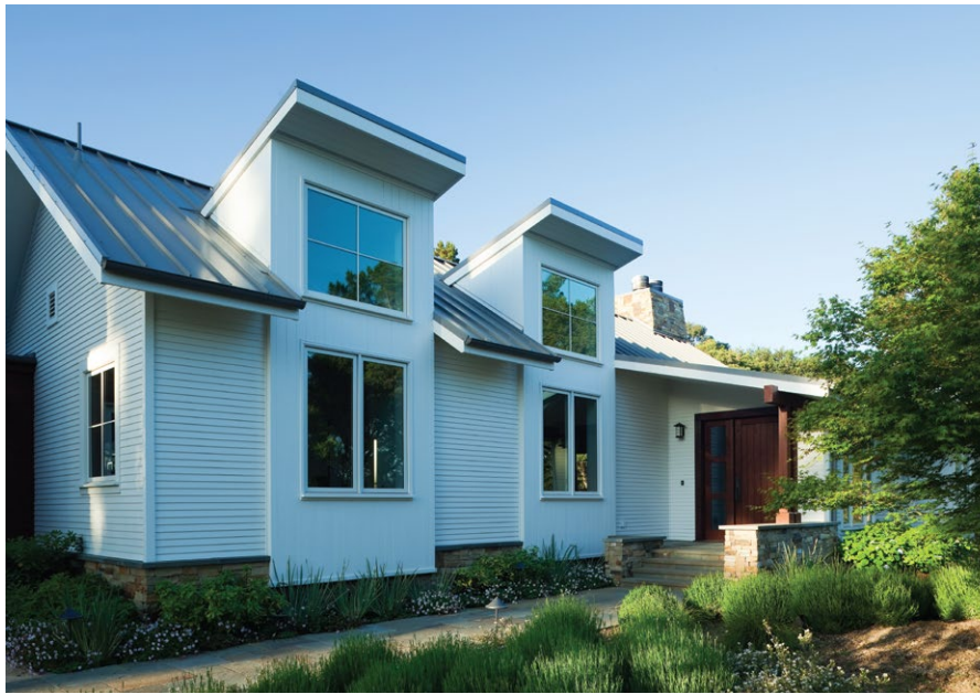
Kitchen and dining room shed dormer window bays.