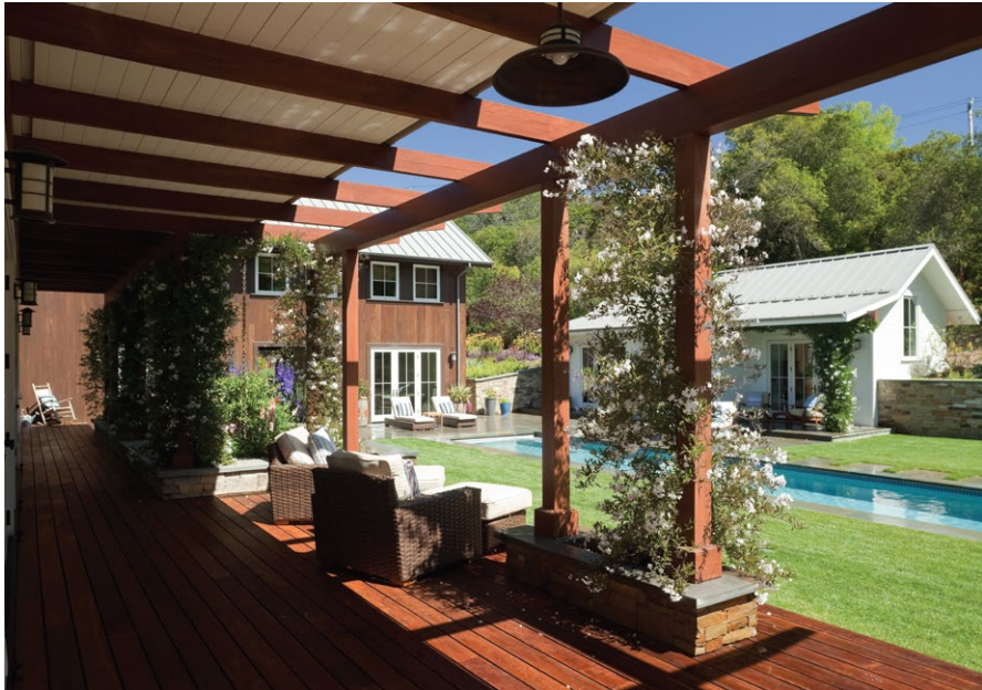
Partially shaded wood porch.