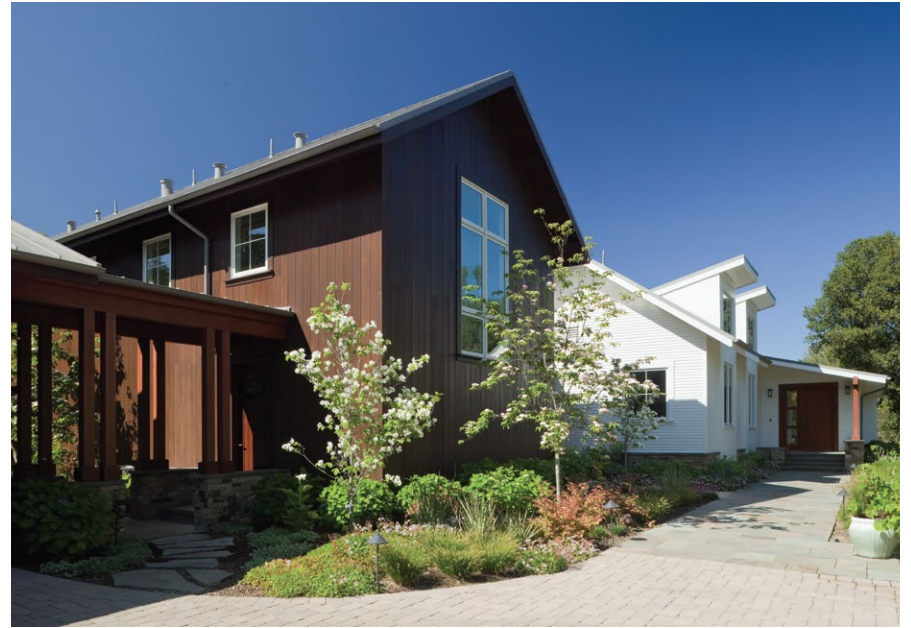
View of entrance, shed dormers, two story barn wing, and breezeway to garage.