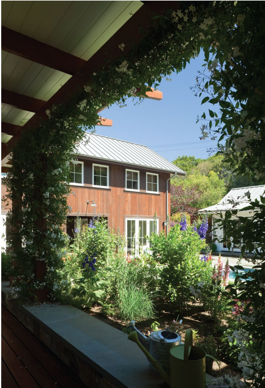
View of porch roof outriggers and planters.