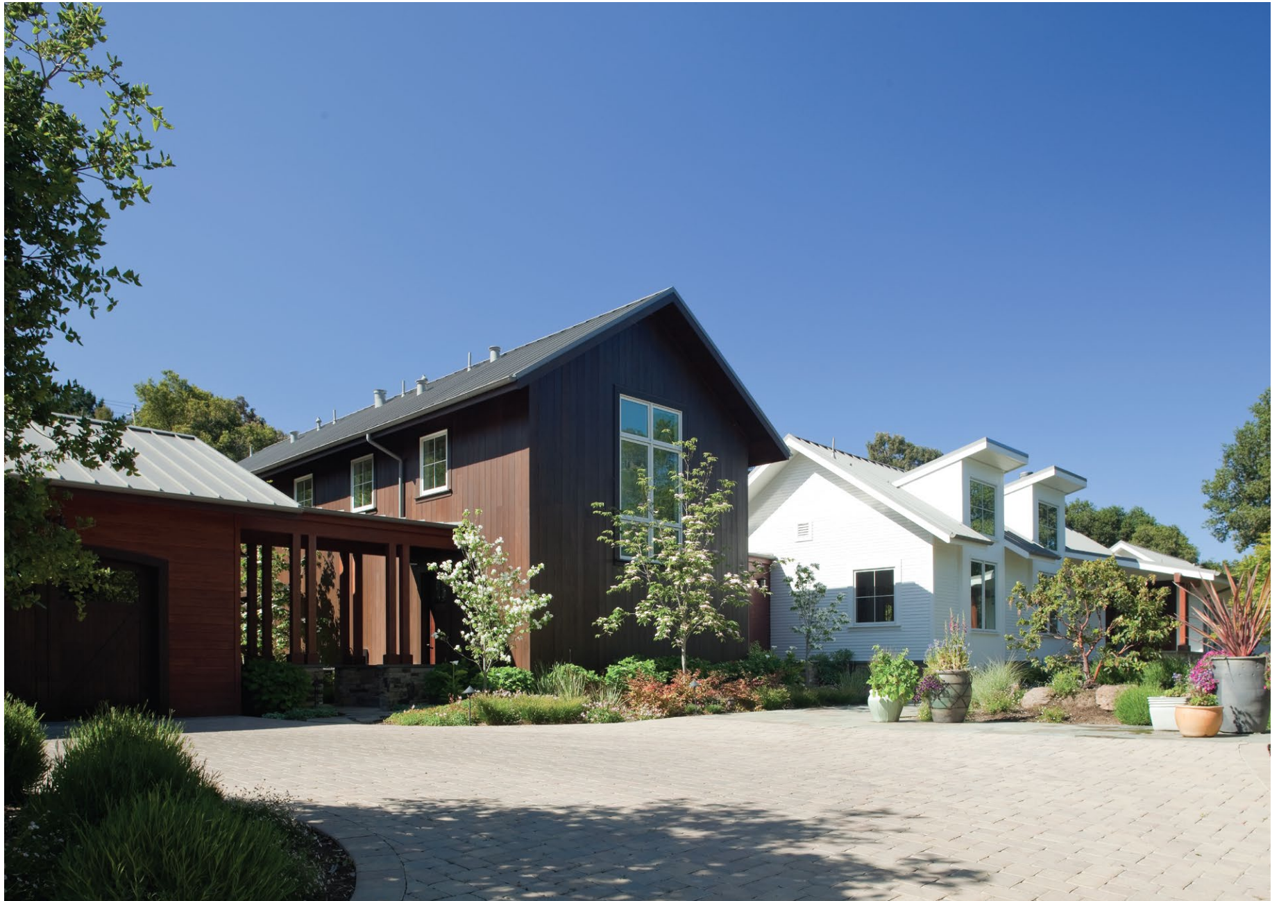
View of garage, breezeway to main house, and two story barn wing.