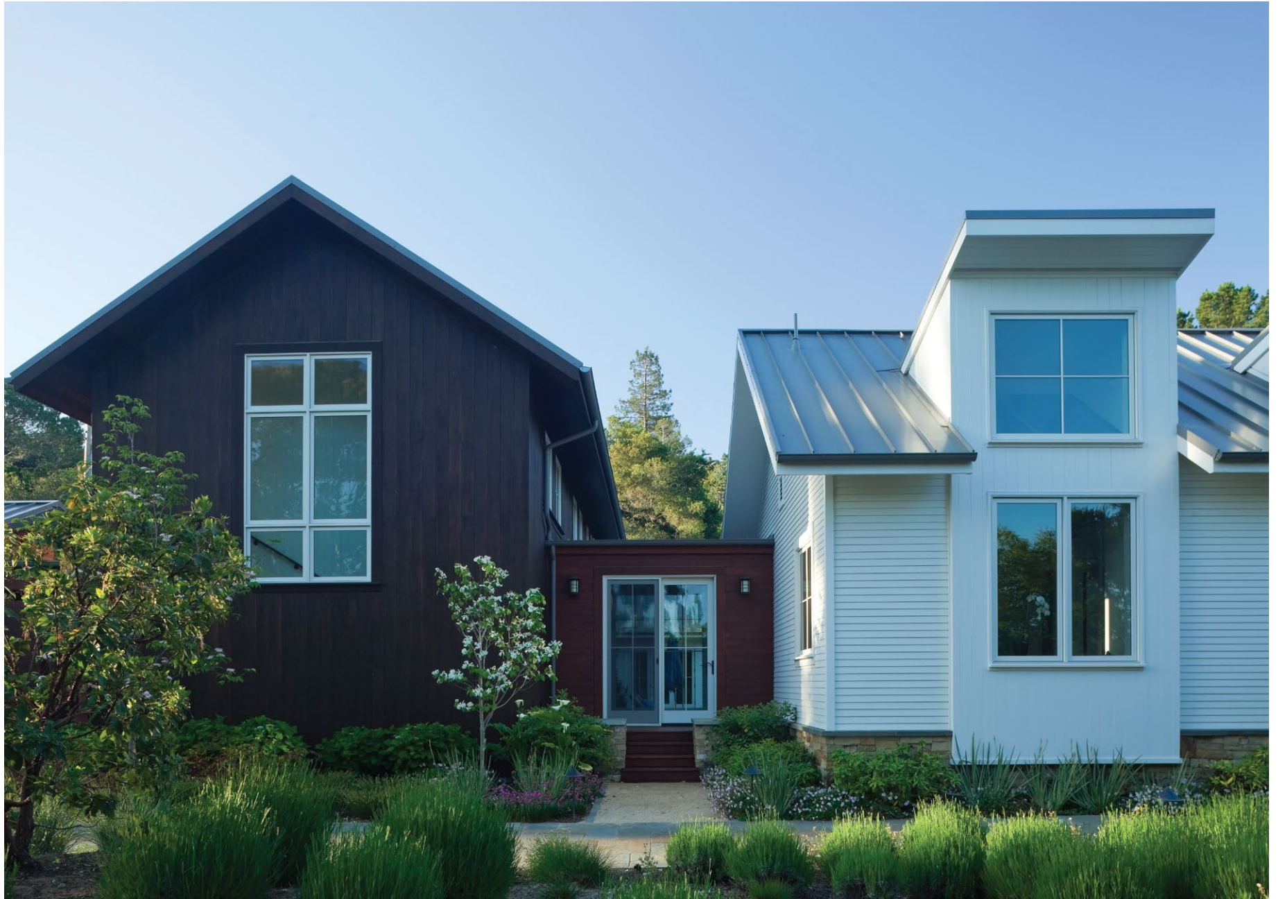
Close up of two story barn wing, connector breezeway, and main house.