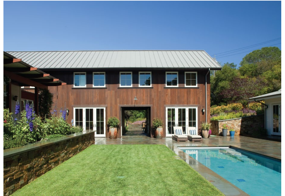
View of two story barn wing and breezeway from pool side.