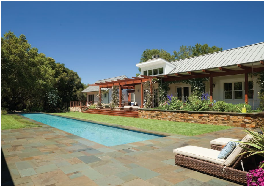
View of main living and great room structure with master suite beyond.