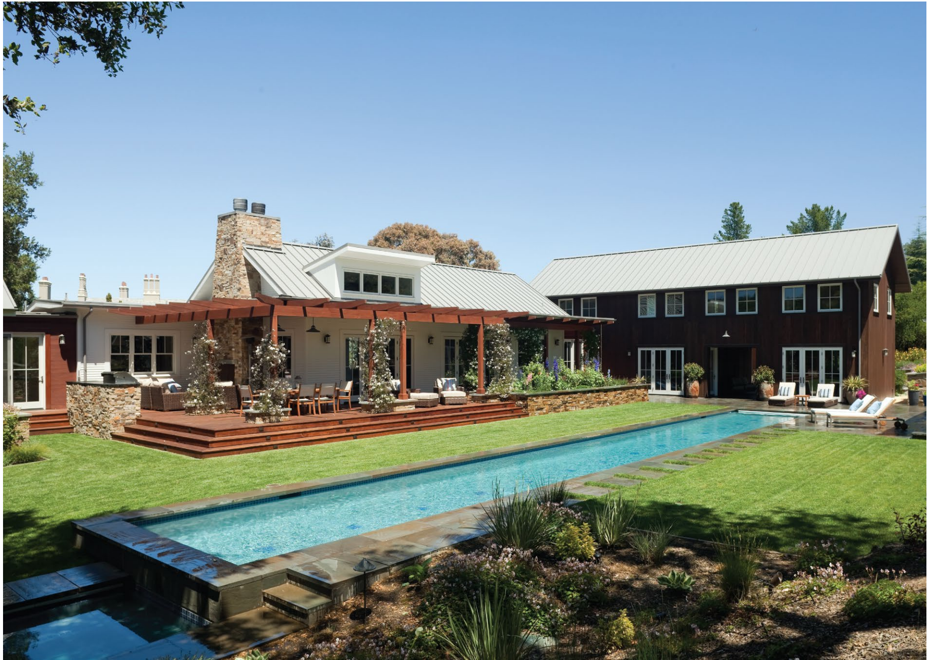
View of main living, dining, and kitchen structure with wood deck, lap pool, and spa.