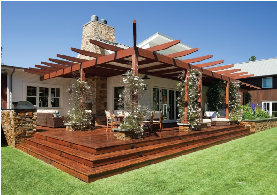
Outdoor living and kitchen with wood trellis.