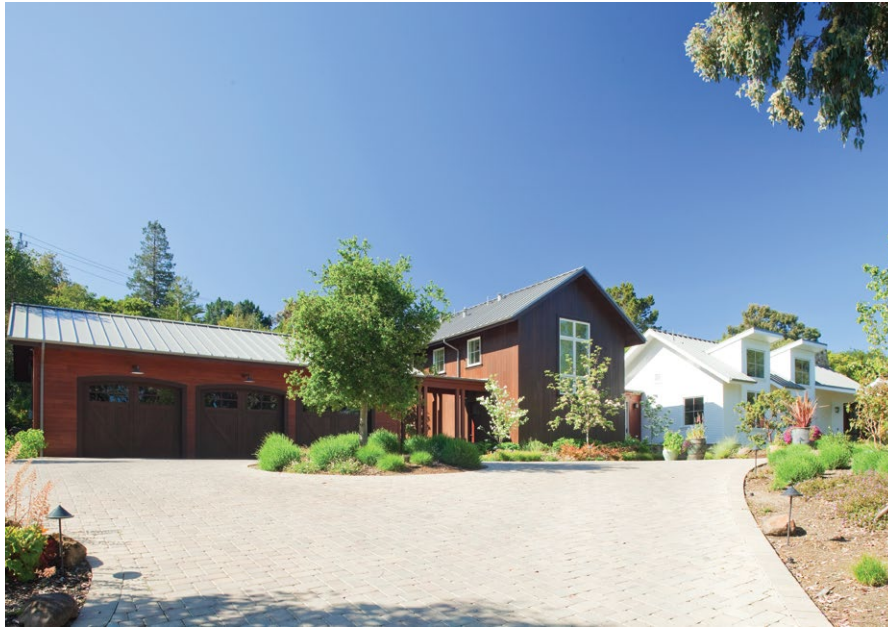
"Sequence of Three" buildings.