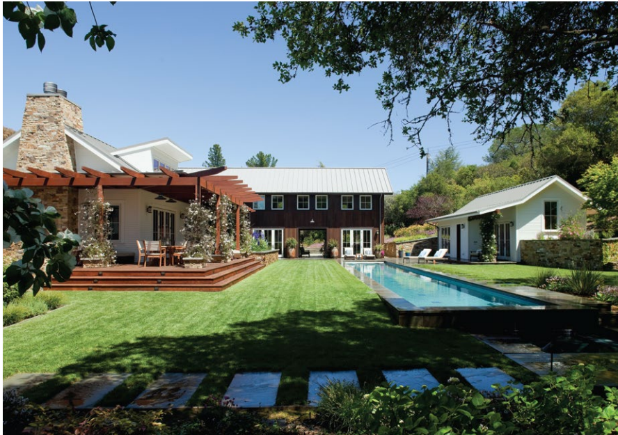
View of main house, two story barn wing with breezeway, and pool house.